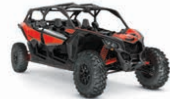
DS ● Turbo Turbo RR ● Turbo Turbo RR ● Turbo Turbo RR