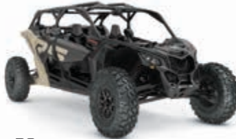
RS ● Turbo RR ● Turbo RR ● Turbo RR