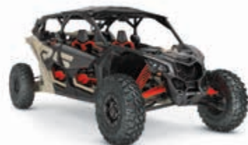
X rs with Smart-Shox ● Turbo RR ● Turbo RR ● Turbo RR