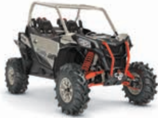
X mr ● 1000R