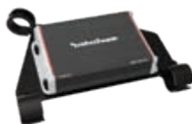
CAN-AM AMPLIFIER KIT X3 715007227