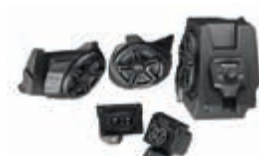
COMPLETE MTX AUDIO SYSTEM X3 715002873