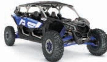
X rs ● Turbo RR ● Turbo RR ● Turbo RR