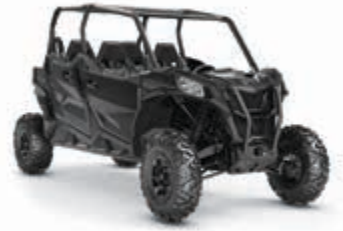
MAX DPS ● 1000R