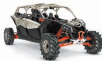
X mr ● Turbo RR

THIS LINEUP IS WIDE OPEN AND THERE FOR THE TAKING.