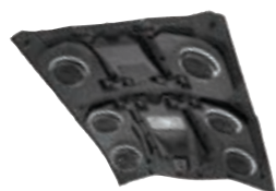
CAN-AM AUDIO ROOF MAX X3 715006709