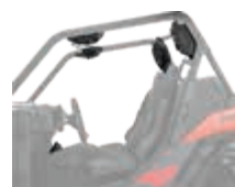
COMPLETE WET SOUNDS AUDIO SYSTEM MTS 715003672