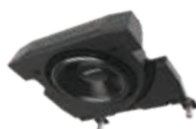
CAN-AM SUBWOOFER X3 715004956 MTS 715006359