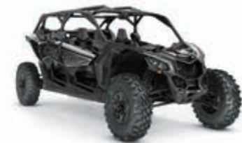
X ds ● Turbo RR ● Turbo RR