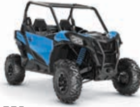
DPS ● 1000R ● 1000R