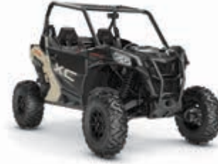
X xc ● 1000R