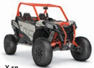
X rc ● 1000R