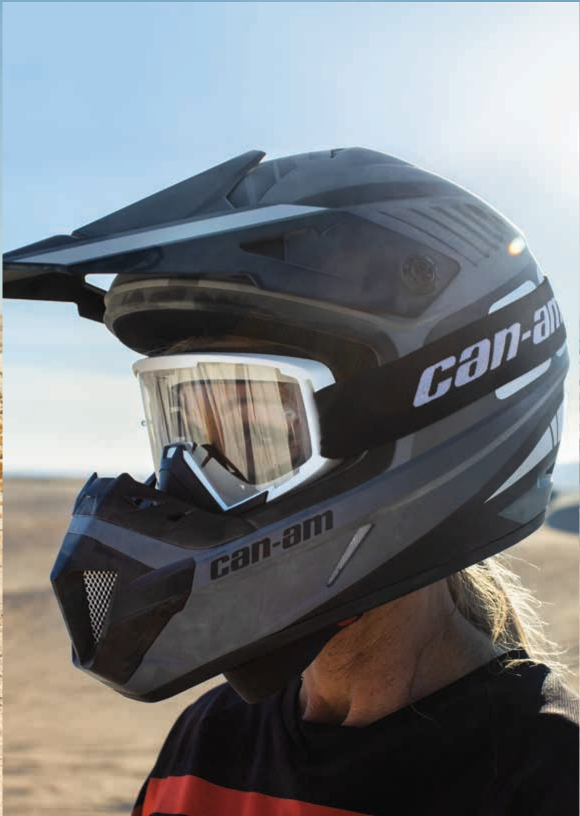
CORRY WELLER CAN-AM PRO RIDER