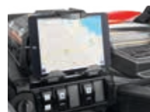
ELECTRONIC DEVICE HOLDER X3 715002874 MTS 715005212