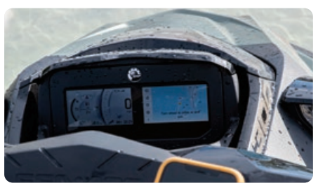
Full-Color 7.8" Wide Display

The industry's first manufacturer-installed truly waterproof Bluetooth‡ audio system.