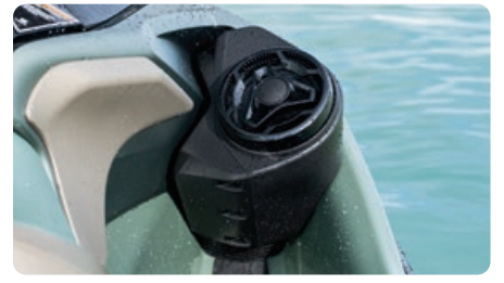
BRP Audio - Premium System

An innovative, industry-first system that allows you to free your pump of weeds and debris with intuitive handlebar-activated controls.