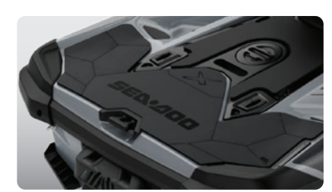
Swim Platform with Integrated LinQ® System

An innovative hull that sets the benchmark for rough water handling, stability, and offshore performance.