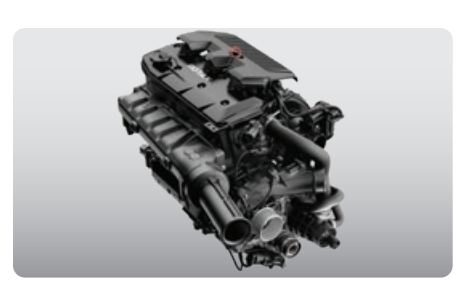
ROTAX® 1630 ACE™ - 300

Full-color display with incredible visibility and a new level of functionality. Bluetooth and smartphone app integration provides music, weather, navigation and more.