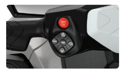
iDF - Intelligent Debris-Free Pump System

An innovative, industry-first system that allows you to free your pump of weeds and debris with intuitive handlebar-activated controls.